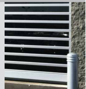
Grey tinted slats shown

*Side columns and head console; excludes US/R models.