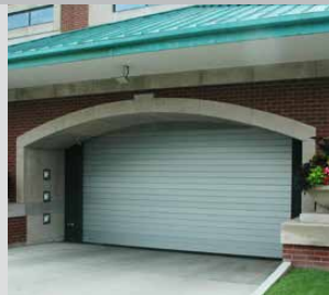
Sleek six inch high slats shown