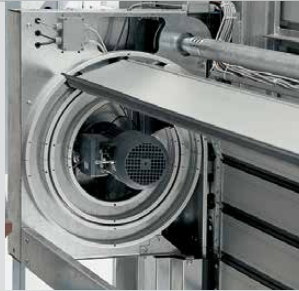
AC drive motor