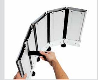
Integral rubber weatherseal