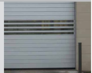
Solid and vision slats shown