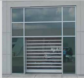
Nine-inch high vision slats for increased visibility