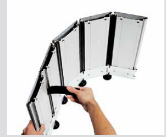
Integral rubber weatherseal