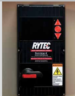
System 4 shown with optional rotary disconnect

Standard maximum sizes shown; larger sizes may be available upon request.