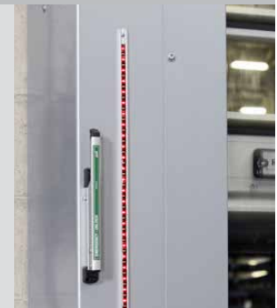
Pathwatch warning lights and brake release lever shown